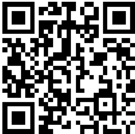
30 minutes ago